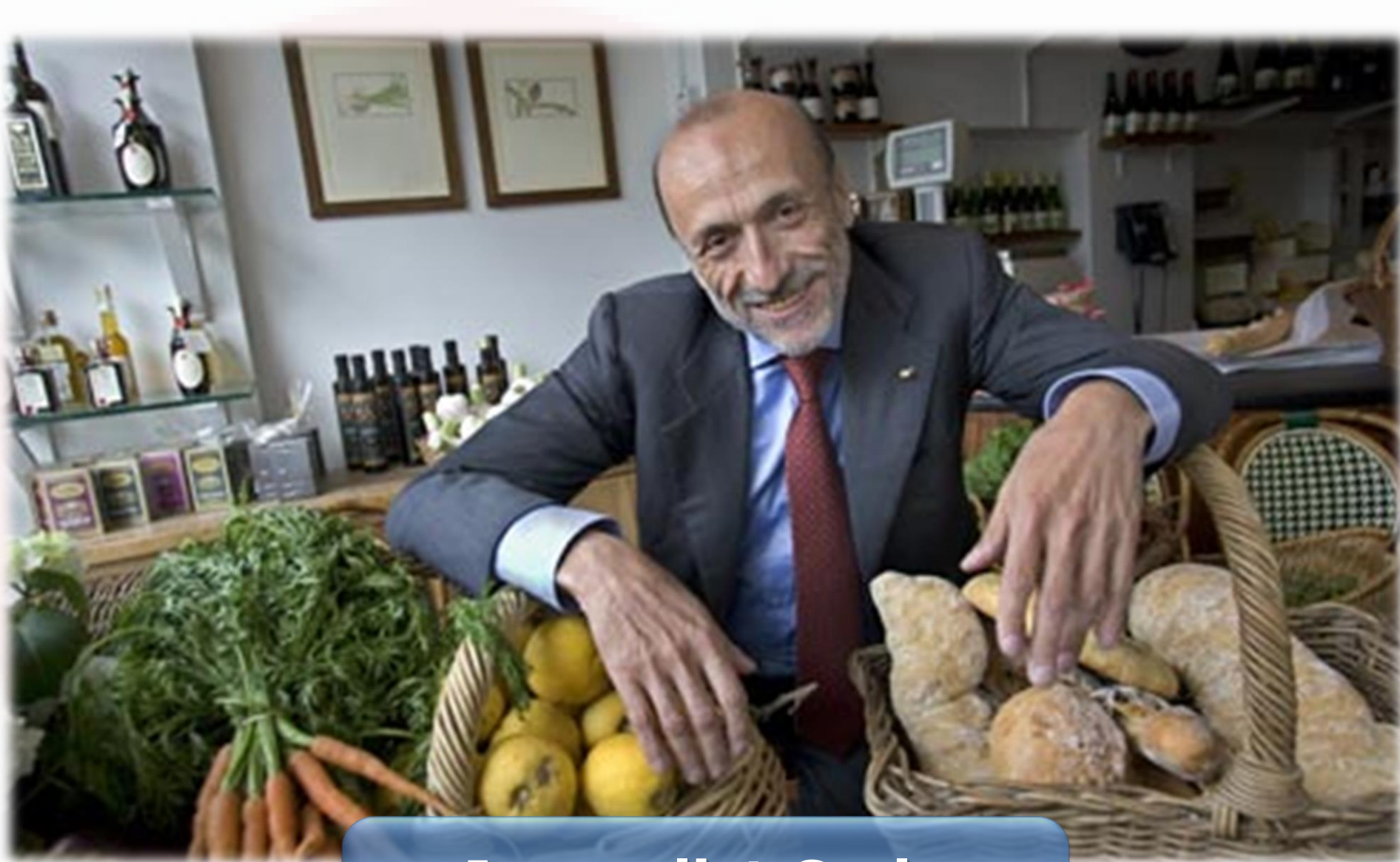
Journalist Carlo Petrini.